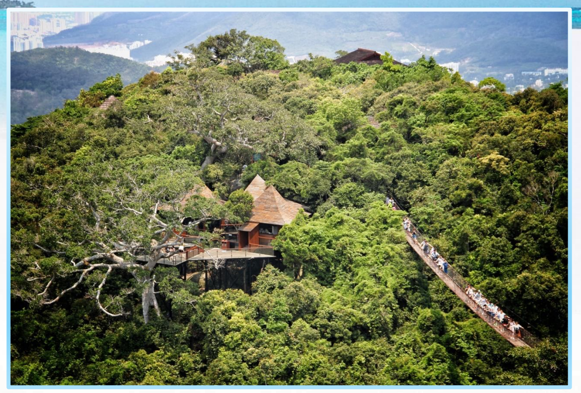
Tropical Paradise Forest Park

A beautiful seaside promenade, area of Beach Run and Open Water Swimming, 3km west of the hotel