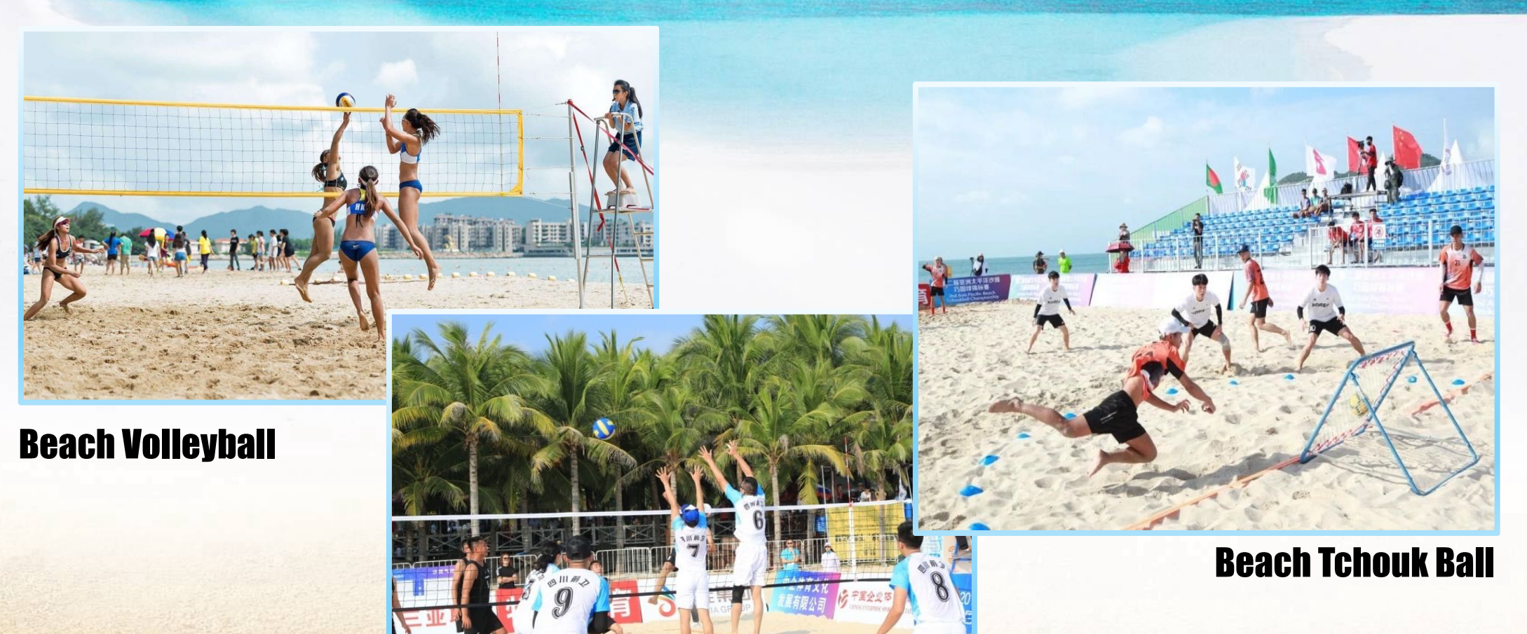
Beach Light Volleyball