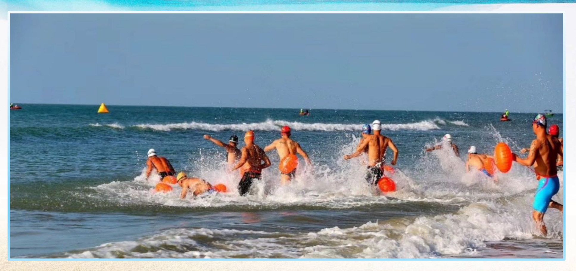
Open Water Swimming